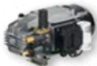
Mod. 610 (HPV)